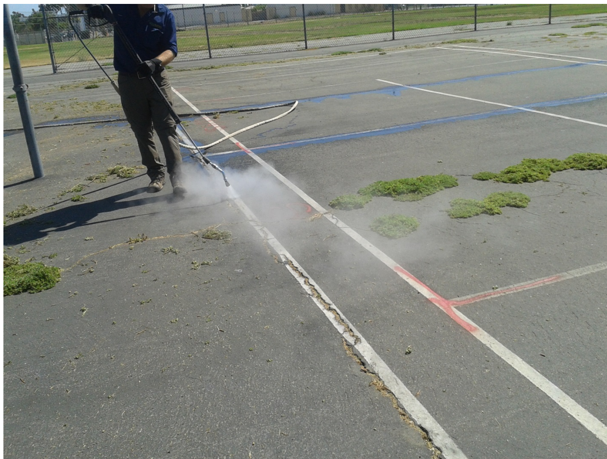
Steam weeder.

Where flammable materials are present, steam or hot foam weeding are preferred over flame weeding. The effect is similar to that of flaming. Commercial equipment is available that use pressurized steam (e.g. WeedTechnics™ ) or hot water + foaming agent (e.g. FoamStream, Weedingtech™ ). These machines remove the hazard of fire but do use about 60 gal of water per hour of use. Also, the output from these devices is HOT and accidental contact with the foam or steam can cause severe burns.